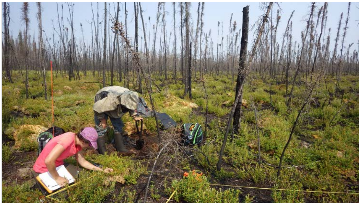
Figure 3. Photo of a burned site (fire SS3) near Kakisa.