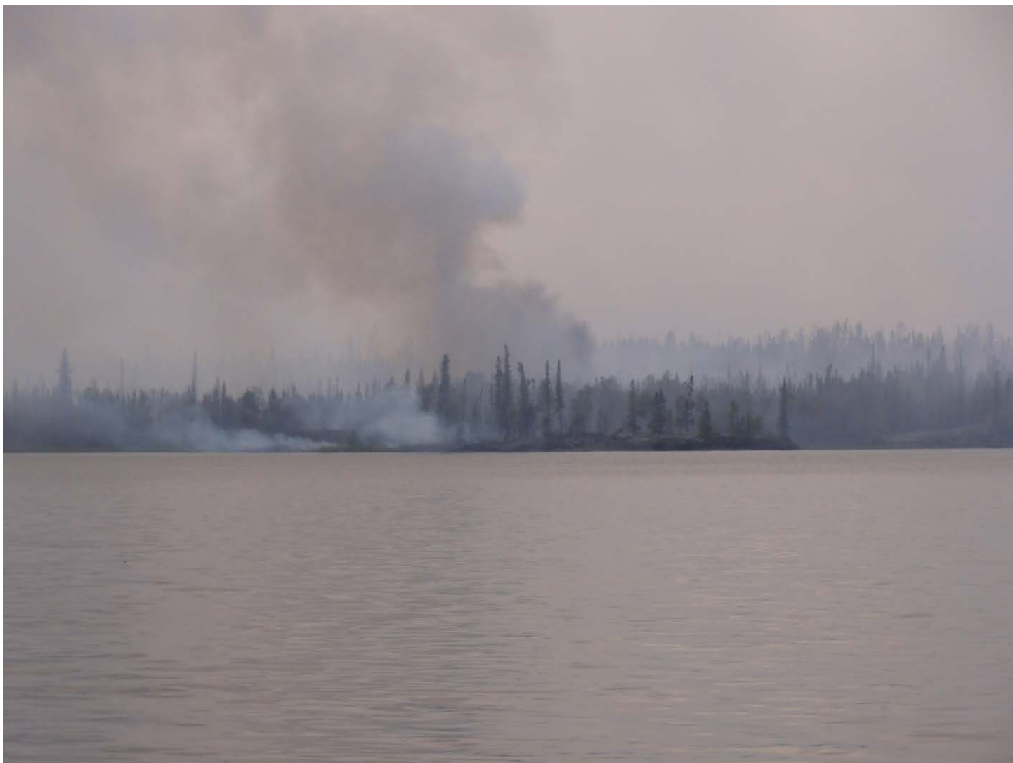
Figure 1. Fire (ZF14) burning outside of Yellowknife, NWT.