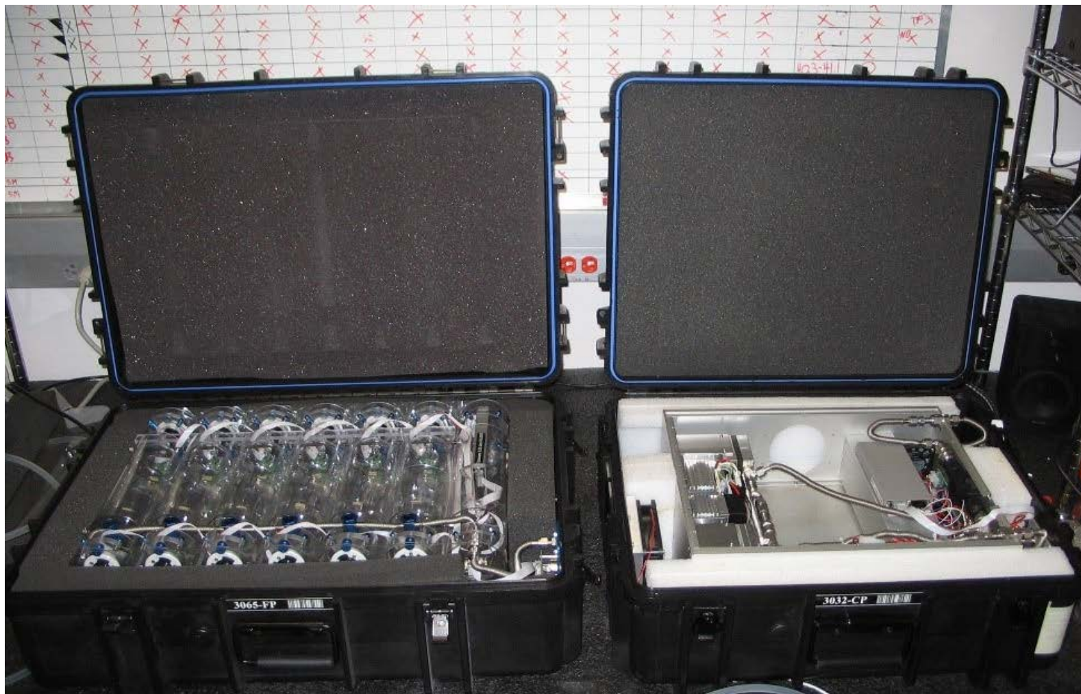
Figure 2. Flask sampling system Left: Programmable Flash Package (PFP) containing 12 flasks. Right: Programmable Compressor Package (PCP) containing pumps for pressurizing the flasks.

A typical sampling routine uses one PCP and one or more PFP(s) that are pre-programmed with a sampling plan dictating the interval for filling each flask. For each sample, the inlet line and compression manifold are flushed with about 5 liters of ambient air. Valves on both ends of the current flask are then opened and the flask is flushed with about 10 more liters of ambient air to displace the dry, low CO 2 fill gas with which the flasks are shipped. The sample flush air is measured by a mass flow meter to ensure that a sufficient volume passes through the manifold and flask before the downstream valve is closed and pressurization begins. Sample flush volumes and fill pressures during sampling are recorded by the data logger, along with ambient temperature, pressure, and relative humidity. GPS position and time stamp are also recorded with each sample.