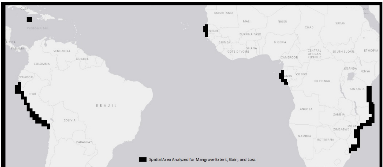
Figure 2. Map showing the areas analyzed for Mangrove Cover in six countries. Vietnam and Bangladesh areas not shown. Files within

The data used to estimate 2016 mangrove landcover consisted of a 30-m resolution Landsat 8 Operational Land Imager (OLI), Sentinel-1 C-SAR, and Shuttle Radar Topography Mission (SRTM) elevation data. Landsat 8 OLI bands were used as inputs for the classification, as well as the normalized band ratios of Normalized Difference Vegetation Index (NDVI), normalized water index, normalized burn ratio, etc. Additionally, annual maximum ‘VV’ and ‘VH’ bands from Sentinel-1 C-SAR and elevation data from SRTM were resampled to the Landsat projection and included in the classification. Data from Landsat provide information on vegetation function and the radar imagery provides information on forest structure. The annual 2016 Landsat composite was classified into mangrove and non mangrove classes.