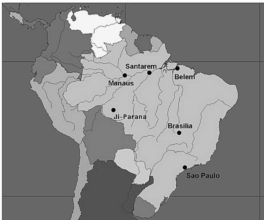
Figure 1. Map of Brazil and other countries in South America, with the locations of the cities (Santarém, Manaus, and Ji-Paraná) near the field sampling sites.

This data set reports the measurement of stable carbon, nitrogen, and oxygen isotope ratios in organic material (plant, litter and soil samples) in forest canopy profiles and pasture (grasses and shrubs) as well as corresponding carbon and nitrogen tissue concentrations in a number of different sites across Brazil. The sampling design captured the temporal variation in rainfall from 1999-2004. Carbon and nitrogen isotope ratios can act as a proxy for interpreting aspects of the carbon and nitrogen cycles in Amazonian rainforests. Data are in three comma-delimited ASCII files.